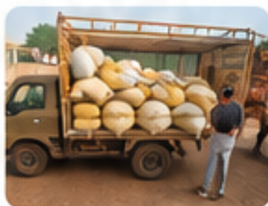
Food & Supply Support