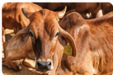
Care & Compassion