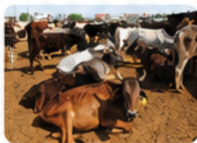
Shelter & Safety