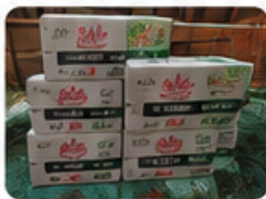
Medicines & Treatments